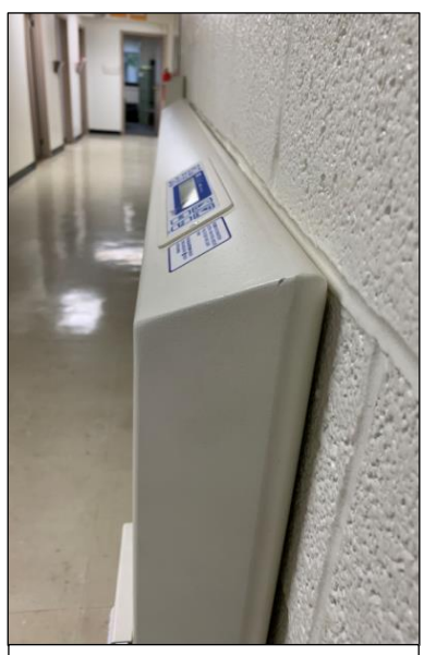
Side view of SR Scales' Wall Mount Scale, width of 3.25"

Larger wall mount scales for weighing patients on stretchers provide hospitals with an attractive and functional alternative to bulky sling or lift scales. The wall mount scale's narrow